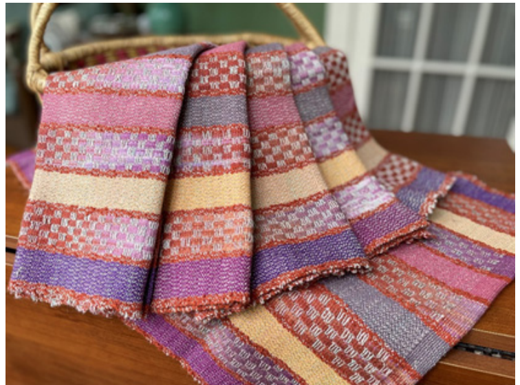
Friendship Towels in Rusty Dusty colorway