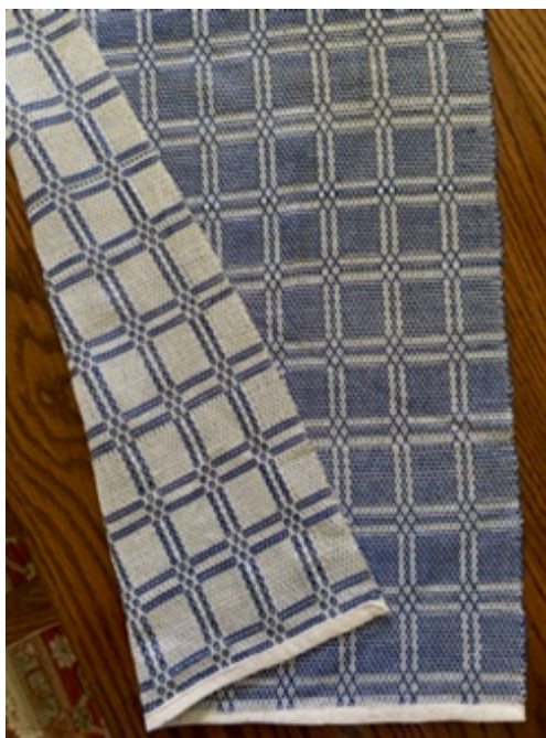
Summer and Winter Tea Towel