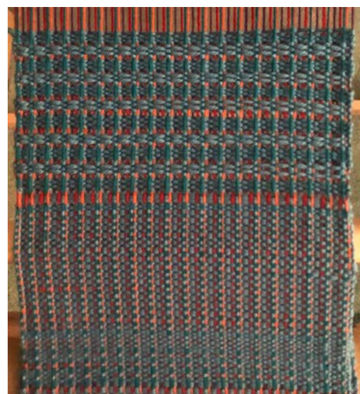
Rigid Heddle Experiments through online classes

Has everyone been working on projects? Would love to see and learn about your favorite projects.