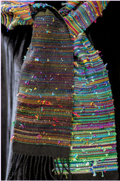
False Satin Scarf