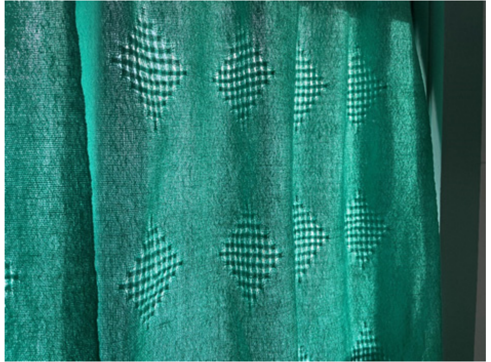
Huck Kitchen Curtains

Beth also wove huck curtains for her kitchen as part of the study. It's an 8 shaft pattern woven of cottolin (warp and weft).